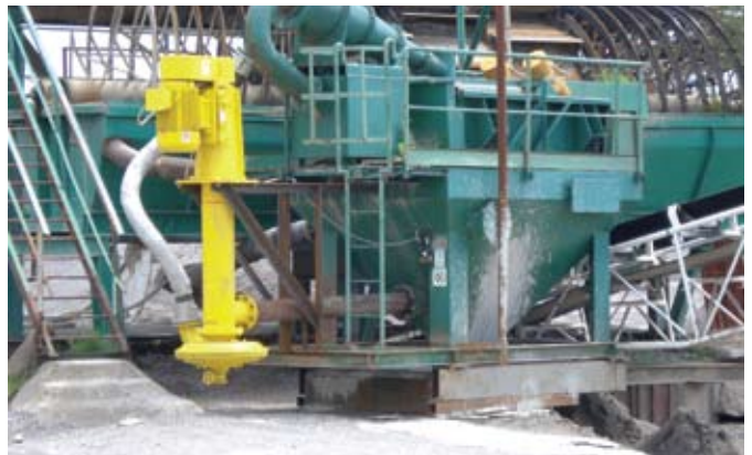
AUS PEMO pump for Hydrocyclone feed application