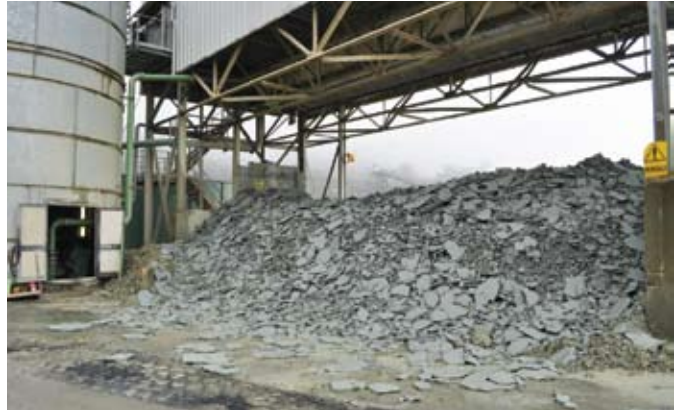
Concentrated slurries by PEMO pumps in 2 x 2 meters filter press