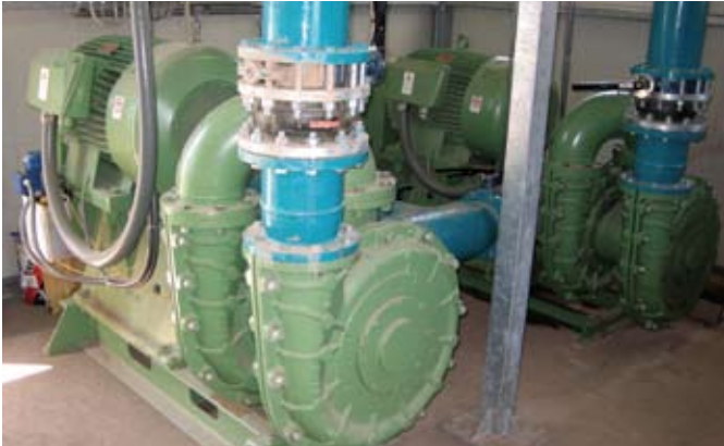
Horizontal double stage PEMO pumps for filter press