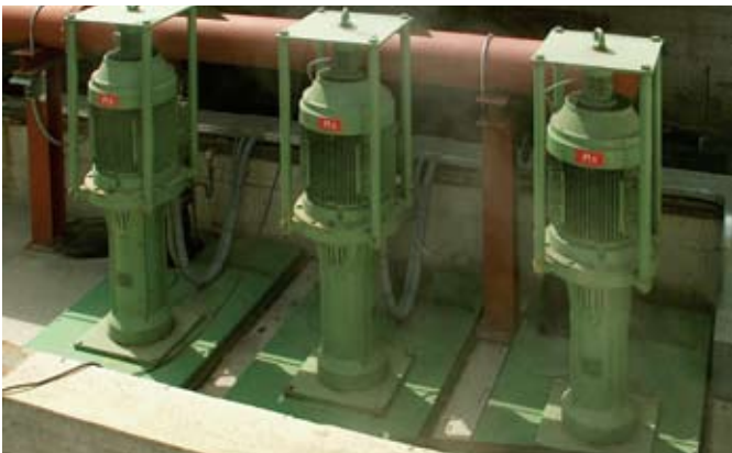
Vertical PEMO pumps for transfer of slurries